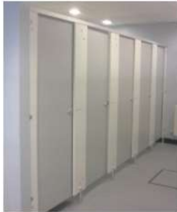
Door: Light Grey Pils & Parts: White