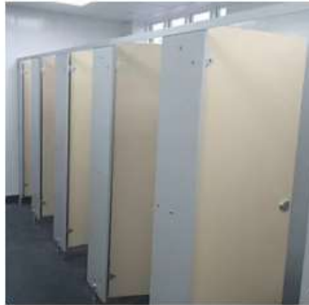
Door: Sand Pils & Parts: Light Grey