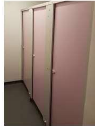
Door: Lavender Pils & Parts: Light Grey