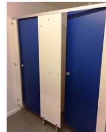
Door: White Pils & Parts: Blue